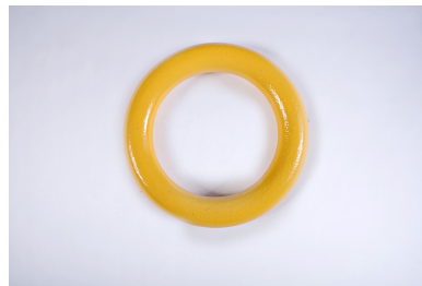
Weldless Round Ring