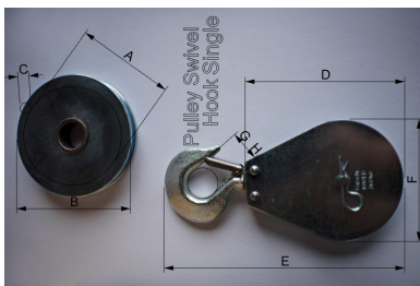
pulley swivel hook single