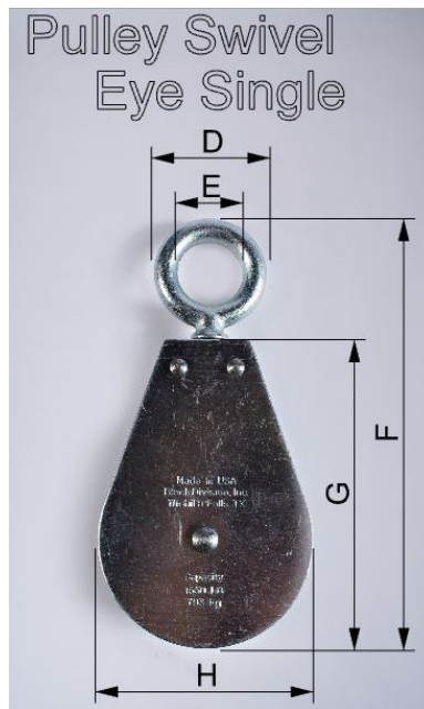
pulley swivel eye single