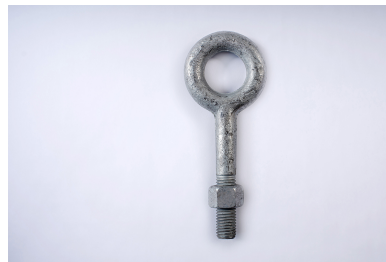
Galvanized Eye Bolt (Non-shouldered)