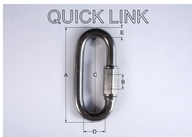
Quick Link Dimension Map