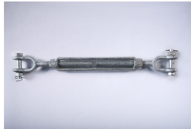
Jaw TBKL WB