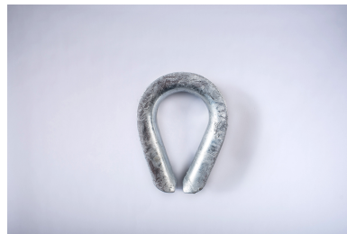
HD Wire Rope Thimble