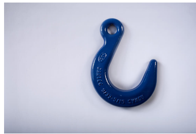
G-100 Eye Foundry Hook