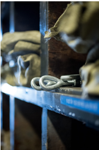
Eye TBKL Shelf SHot