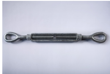
Eye TBKL WB