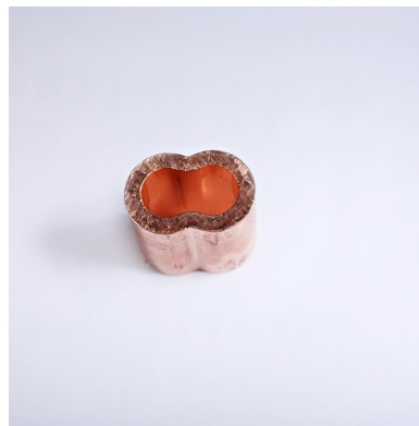
COPPER OVAL SLEEVE KINDA TOP VIEW