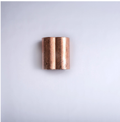
COPPER OVAL SLEEVE SIDE VIEW