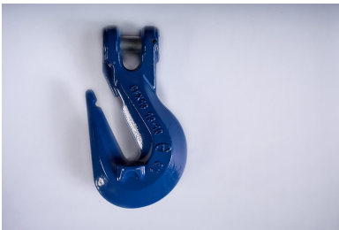
G-100 Clevis Saddle Grab Hook A