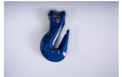
G-100 Clevis Saddle Grab Hook B