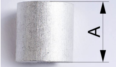
stop sleeve alum