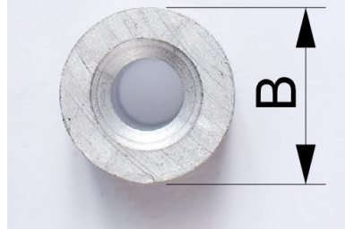
stop sleeve alum2