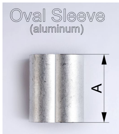
Oval Sleeve Alum