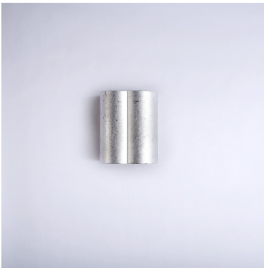
ALUMINUM OVAL SLEEVE SIDE VIEW