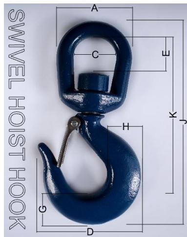
swivel hoist hookDM