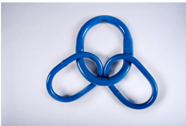
G-100 Master Link With Sub-Assemblies