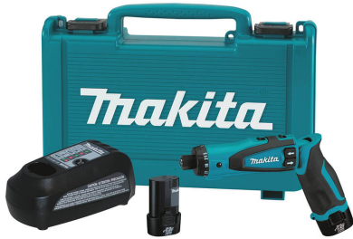
Makita DF010DSE Kit Shot

Makita-built motor delivers 44 in.lbs. of Max Torque in a compact design. Built-in L.E.D. light flashes when it is time to recharge the battery. 2-speed design (200 RPM and 600 RPM) for high or low torque applications. Operates in straight or pistol grip positions. 21 clutch settings and drill mode for added fastening control (fastening torque range: 2.7 in.lbs. - 27.0 in.lbs.). Auto-Stop Clutch: Tool shuts off when clutch disengages for extra fastening control and prevents overdriving the fastener. Built-in L.E.D. light illuminates the work area. Convenient 1/4" hex chuck for quick bit changes. Soft grip handle provides increased comfort on the job. Makita 7.2V Lithium-Ion batteries provide longer run time and lower self-discharge. 3-year limited warranty on tool, battery and charger. Only use genuine Makita batteries and chargers.