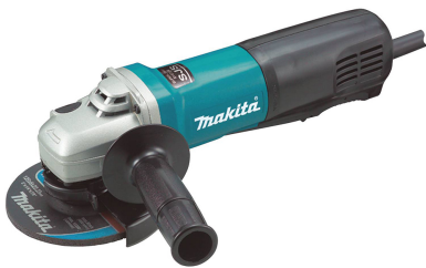
Makita 9565PC Product Shot

Powerful 13.0 AMP motor delivers more output and 10,500 RPM for the most demanding applications. SJS technology is a mechanical clutch system that helps prevent motor and gear damage by allowing the drive shaft to slip if the wheel is forced to stop. Constant speed control automatically applies additional power to the motor to maintain speed under load. Electronic current limiter helps protect the motor from overload. Soft start suppresses start-up reaction for smooth start-ups and longer gear life. Labyrinth construction seals and protects the motor and bearings from dust and debris for longer tool life. Large no lock-on paddle switch with lock-off for comfortable operation. "Tool-less" wheel guard adjustment for easy adjustment. Two position adjustable side handle for operator convenience. Compact design at only 12-1/8" long and weighs only 5.3 lbs.