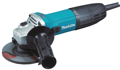
Makita GA4530 Product Shot

Powerful 6.0 AMP motor delivers 11,000 RPM for the most demanding applications. Compact design at only 4.0 lbs. for reduced operator fatigue. Labyrinth construction seals and protects the motor and bearings from dust and debris for longer tool life. Slide switch design with lock-on for added user convenience. Protective zig-zag varnish seals the armature from dust and debris for longer tool life. All-ball bearing design and metal gear housing for added durability. Machined bevel gears provide up to 2x longer service life than previous models. Side handle is positioned at an increased 20° angle for added comfort. Two position adjustable side handle for operator convenience. Double insulated.