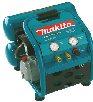
Makita MAC2400 Product Shot