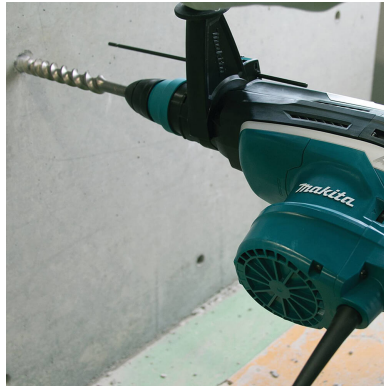
Makita HR5212C Action Shot 2