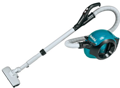
Makita DCL500Z Product Shot

Powerful motor generates 46 CFM of suction power and 26.5" of water lift. Up to 49 minutes of continuous operation using a 5.0Ah LXT® battery (battery not included). Filtration system with cyclonic separation keeps motor running at optimum performance. Cyclonic system separates large dust particles from fine dust particles so that only fine dust particles are captured on the filter for reduced clogging. Compact design at only 13-7/8" long. Weighs only 9.4 lbs. with battery (battery not included) for reduced operator fatigue. Push button air volume selection (High/Low) for controlled vacuuming. L.E.D. filter cleaning and battery charge warning lights indicate when to clean or recharge batteries. Filter cleaning lever removes dust from the filter without removing filter from vacuum for convenience. Quiet operation at only 64 dB(A) for operator comfort. Telescoping extension wand provides 38" - 40" of reach. Easy removal of dust collection container for convenient dust disposal and cleaning. Includes floor and crevice nozzles for a variety of application. Shoulder strap for maximum versatility and portability. Reusable dust filter is easy to clean. Unique wheel design for maximum maneuverability. Equipped with Star Protection Computer Controls to protect against overloading, over-discharging and over-heating. Battery and charger sold separately. 3-year limited warranty. Only use genuine Makita batteries and chargers.