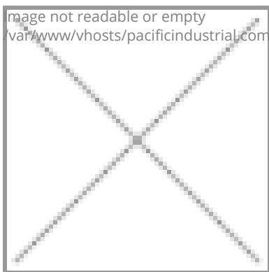
Makita HM1111C Beauty Shot 1

Powerful 14 AMP motor delivers 12.7 ft.lbs. of impact energy to handle the most demanding applications. Anti-Vibration Technology is an internal counterbalance system that greatly reduces vibration for increased user comfort and greater productivity. Detached rear handle is spring loaded and engineered to provide less vibration and more control. Constant speed control automatically applies additional power to the motor to maintain speed under load to complete the most challenging jobs. Soft start suppresses start-up reaction for more control and better accuracy. Variable speed control dial enables user to match the speed to the application for greater versatility. L.E.D. service light notifies the user approximately 8 hours before the brushes need to be replaced. L.E.D. power light indicates switch failure or cord damage. Extended life brushes are longer for more work between service intervals and less downtime. Automatic brush cut-off protects commutator from damage for longer tool life. 12 bit angle settings allow the bit to be set at different positions for operating convenience. One-touch chuck allows for quick bit changes. "No hammering when idling" function helps increase tool life. Easy-to-operate slide switch increases productivity and allows for continuous use. Side handle swivels 360° for greater control.