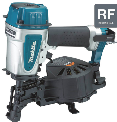
Makita AN453 Feature Shot (with RF icon)

Aluminum housing for longer tool life. "Tool-less" depth adjustment engineered for more precise control and flush nailing. "Tool-less" shingle guide designed for easy adjustments and consistent shingle placement. Built-in magnet ensures last nail is driven. Large carbide inserts on nose piece for long lasting performance. Rubberized handle for better fit and added comfort. Easy loading adjustable canister system allows for faster, more precise loading. Oversized steel wear plates reduce abrasion on tool. Nose assembly can be easily removed for cleaning or maintenance. Only 5.2 lbs. for less weight and more power. Adjustable tool hook allows tool to remain close by but never in the way. Minimum recommended air delivery of 2.8 SCFM @ 90PSI. 3-year limited warranty.