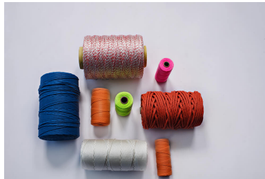
CWT Group (2)