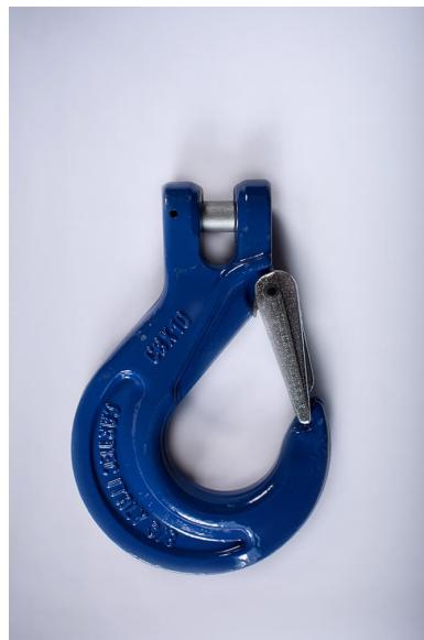
G-100 Clevis Sling Hook Latch