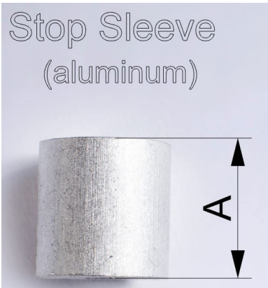
stop sleeve alum