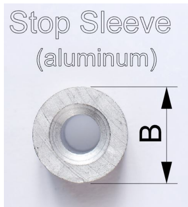
stop sleeve alum2