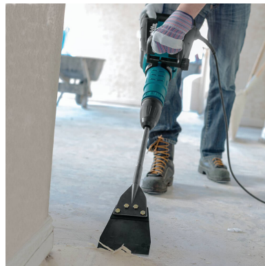
Makita HM1214C Action Shot 4