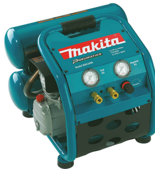
Makita MAC2400 Product Shot